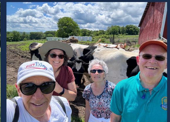
In early June, we enjoyed a successful walk across the district with friends and supporters.